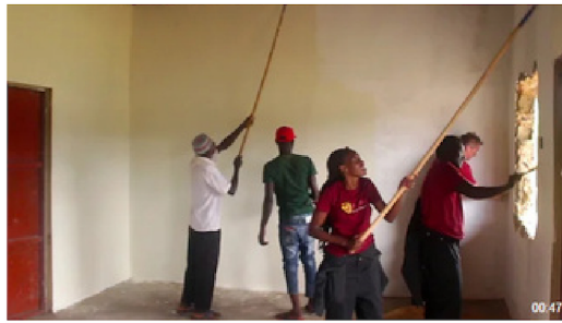
Start of renovations, 2022