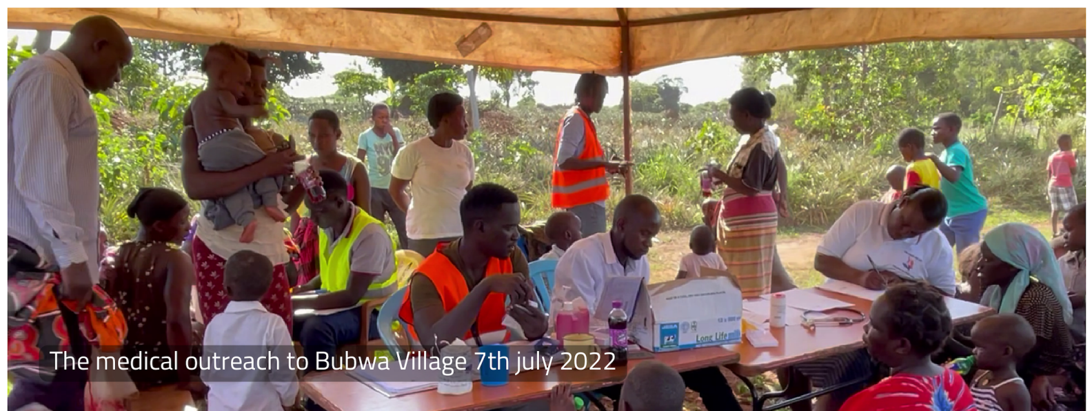
The medical outreach to Bubwa Village 7th July 2022