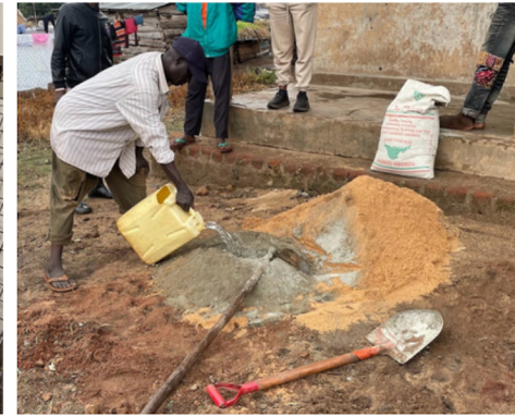
More work done by the builders