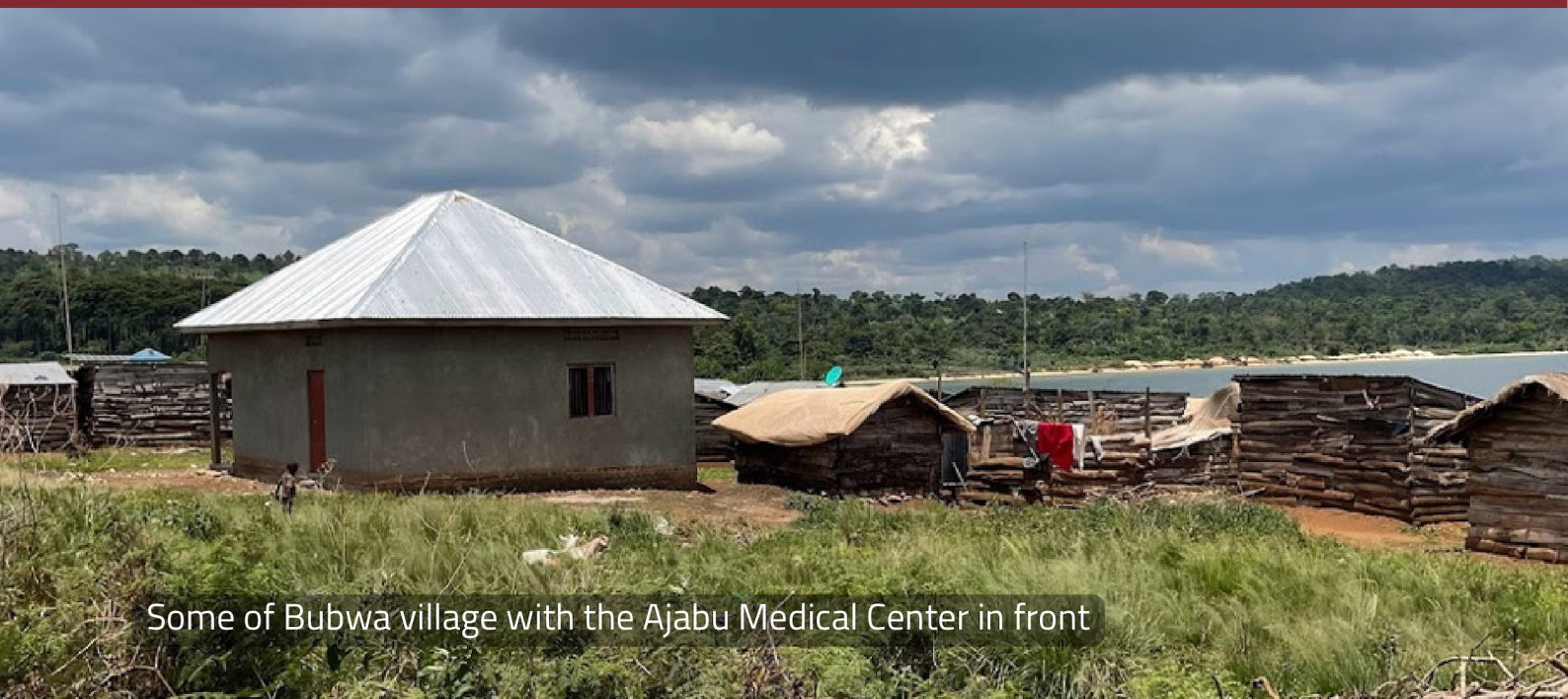
Some of Bubwa village with the Ajabu Medical Center in front