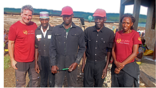
The founders and a team of dedicated workers