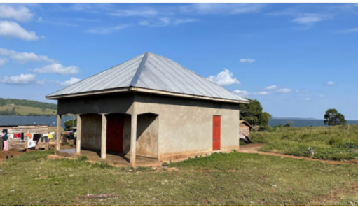
The proposed building