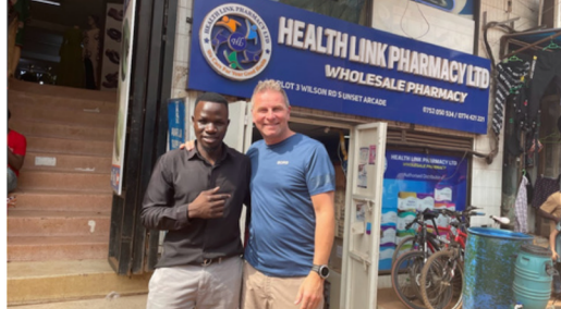
Partnering with a pharmacy to supply medicines to the medical center