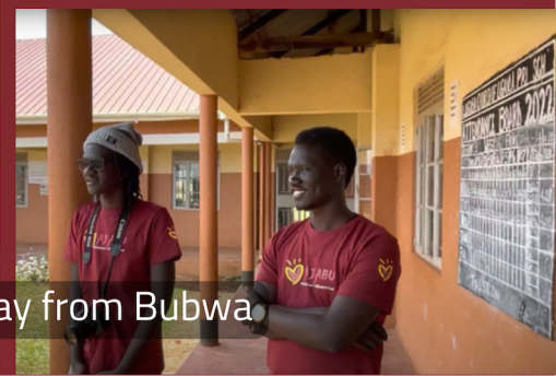
Meeting with heads of our partnering local schools, 17 km away from Bubwa