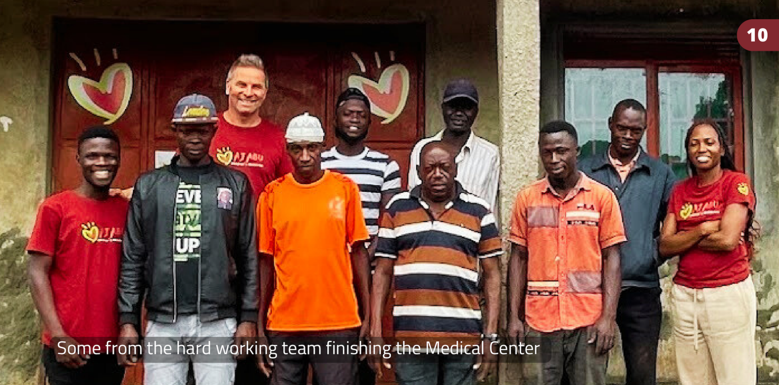
Some from the hard working team finishing the Medical Center