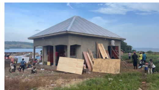
Starting the work on 30. june