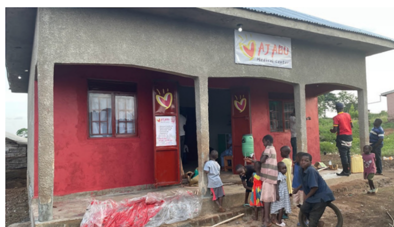
Ajabu Medical center on 2. july 2023!