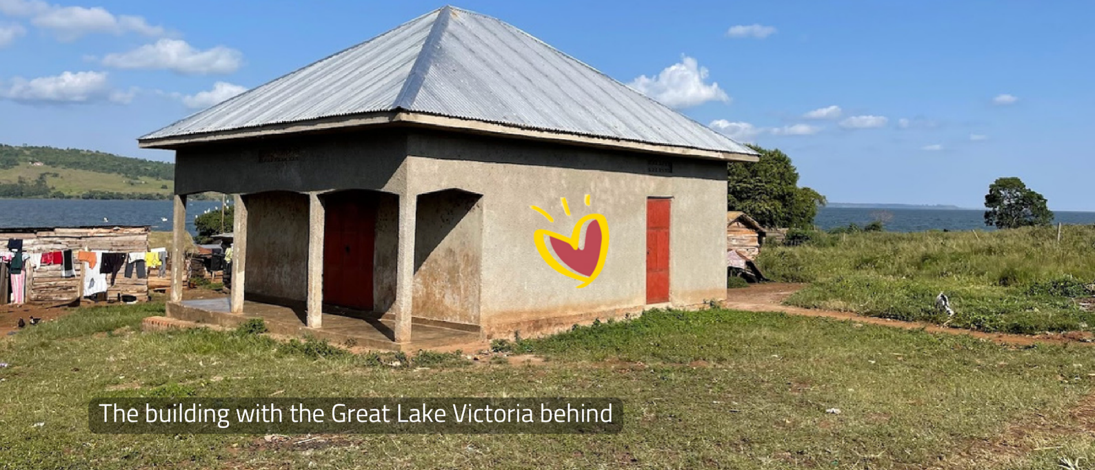
The building with the Great Lake Victoria behind