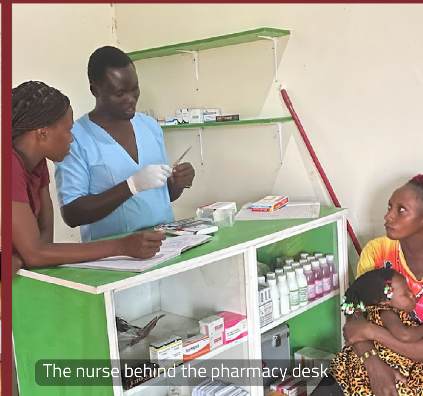
The nurse behind the pharmacy desk