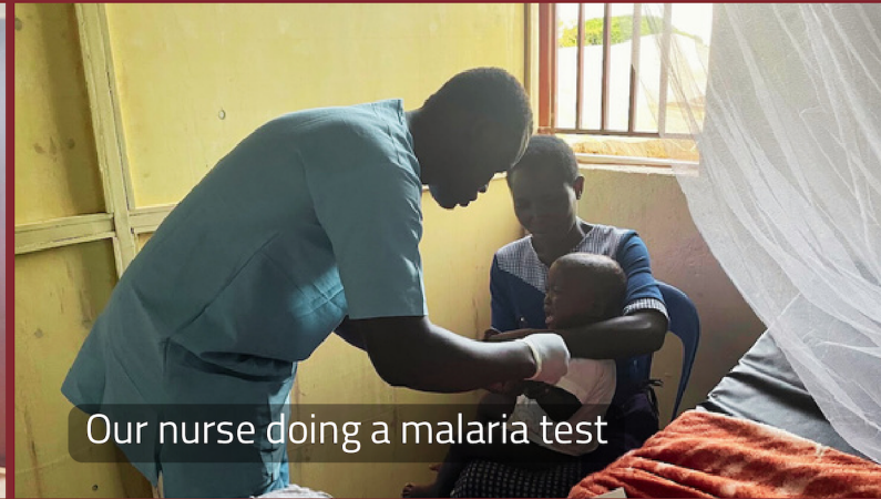
Our nurse doing a malaria test

The medical center offers basic healthcare services and is staffed by dedicated professionals. In 2023, we will have had two nurses and a doctor on rotation. The health center aims to meet the health needs of the disadvantaged population in Bubwa. The center offers services such as general checks, vaccinations and basic medical treatments.