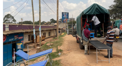
Picking up the equipments for the medical center